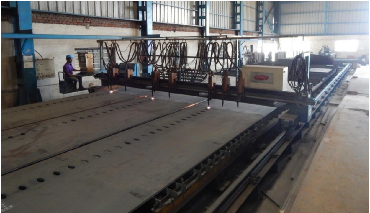
CNC Gas Cutting Machine