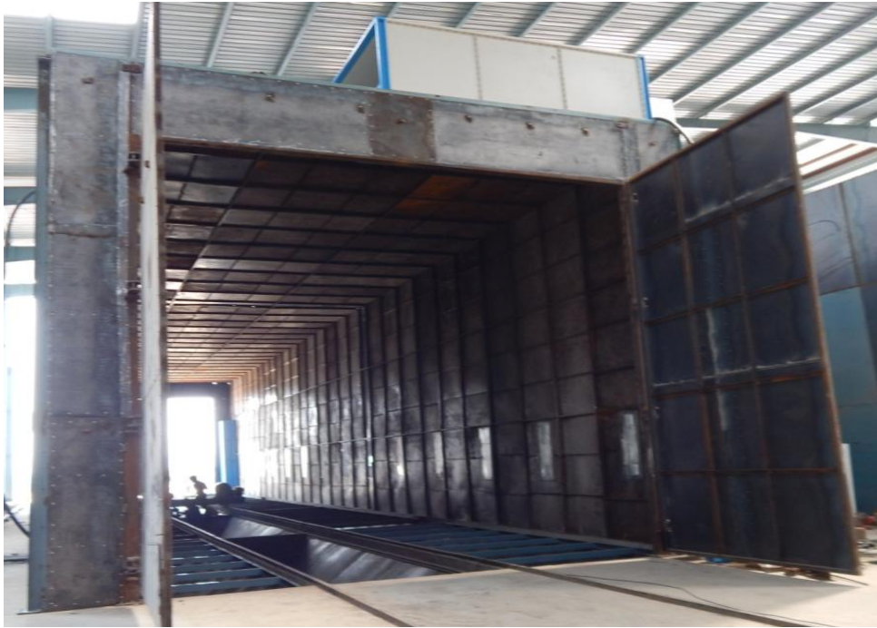
Blasting Booths (3 Nos.)