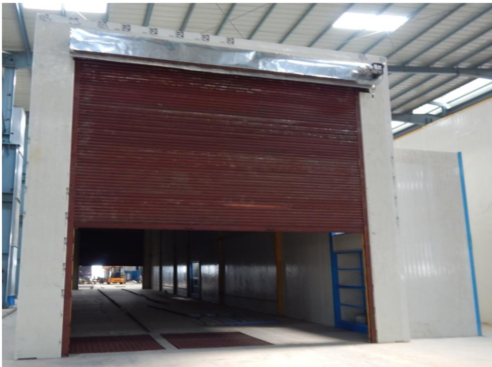
Painting Booths – (5 Nos.)