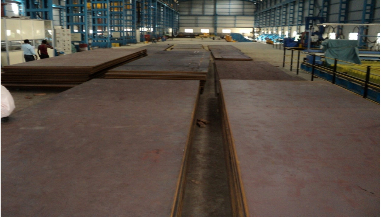
Material Storage Area