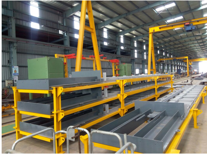
Moving Floor (Forbes Vynke)