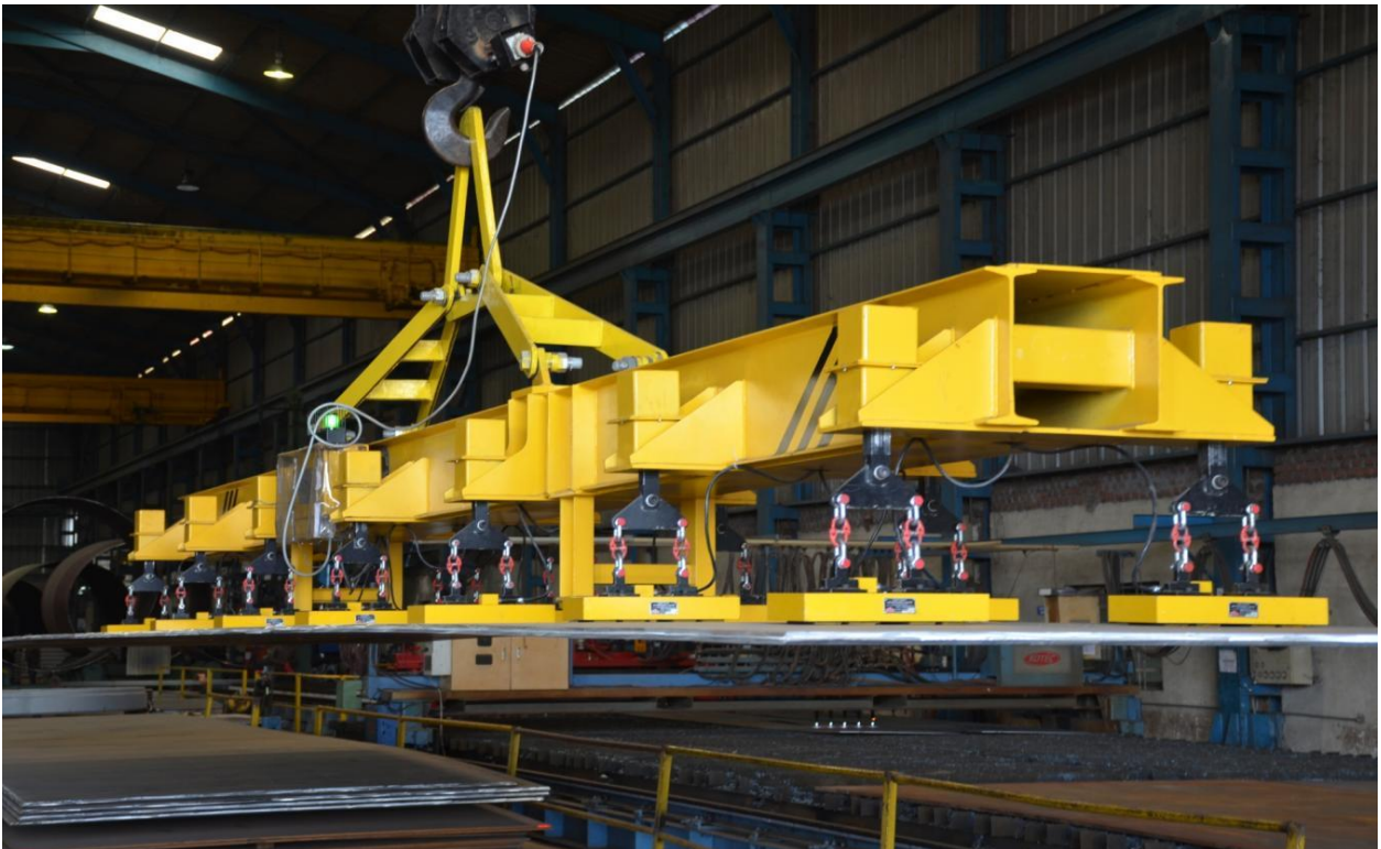
Magnetic Lifters for Plate Handling