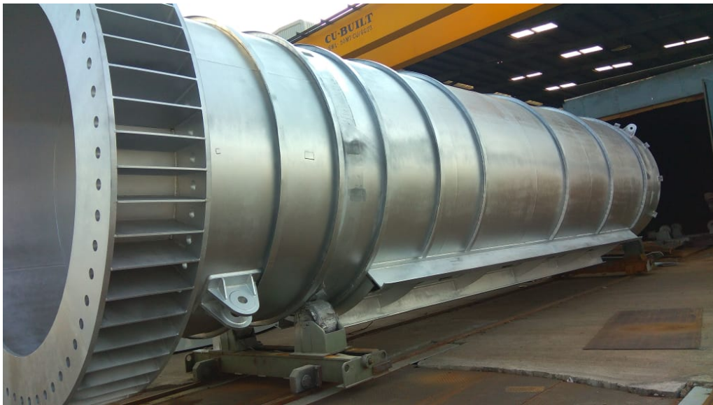
Stack (Chimney) Fabrication