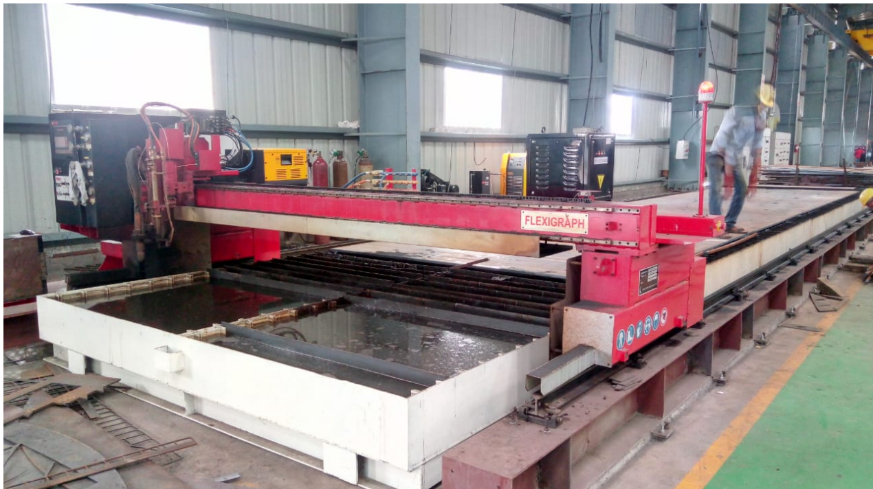
CNC Plasma Cutting Machine