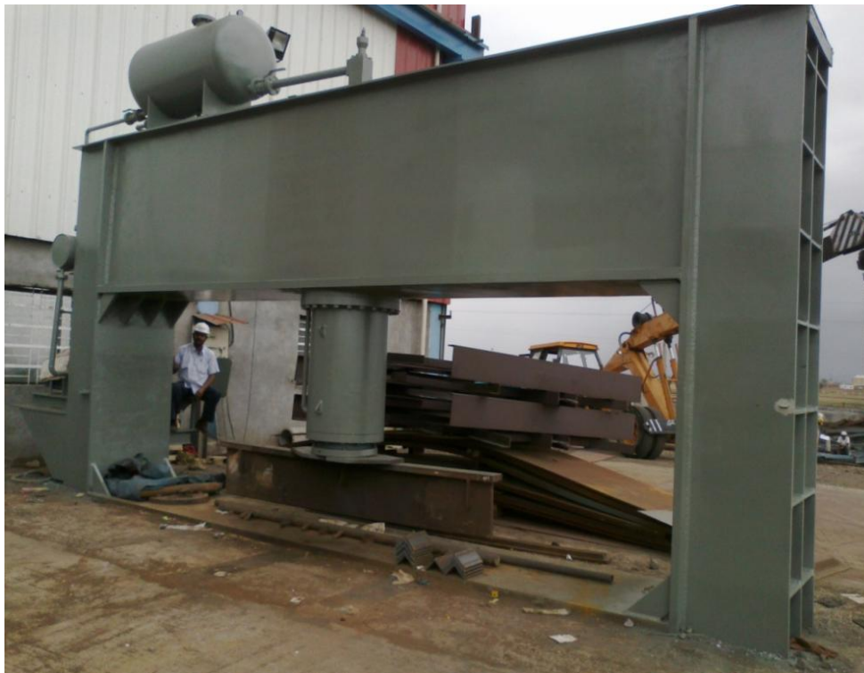
Hydraulic Press – 600 MT Capacity