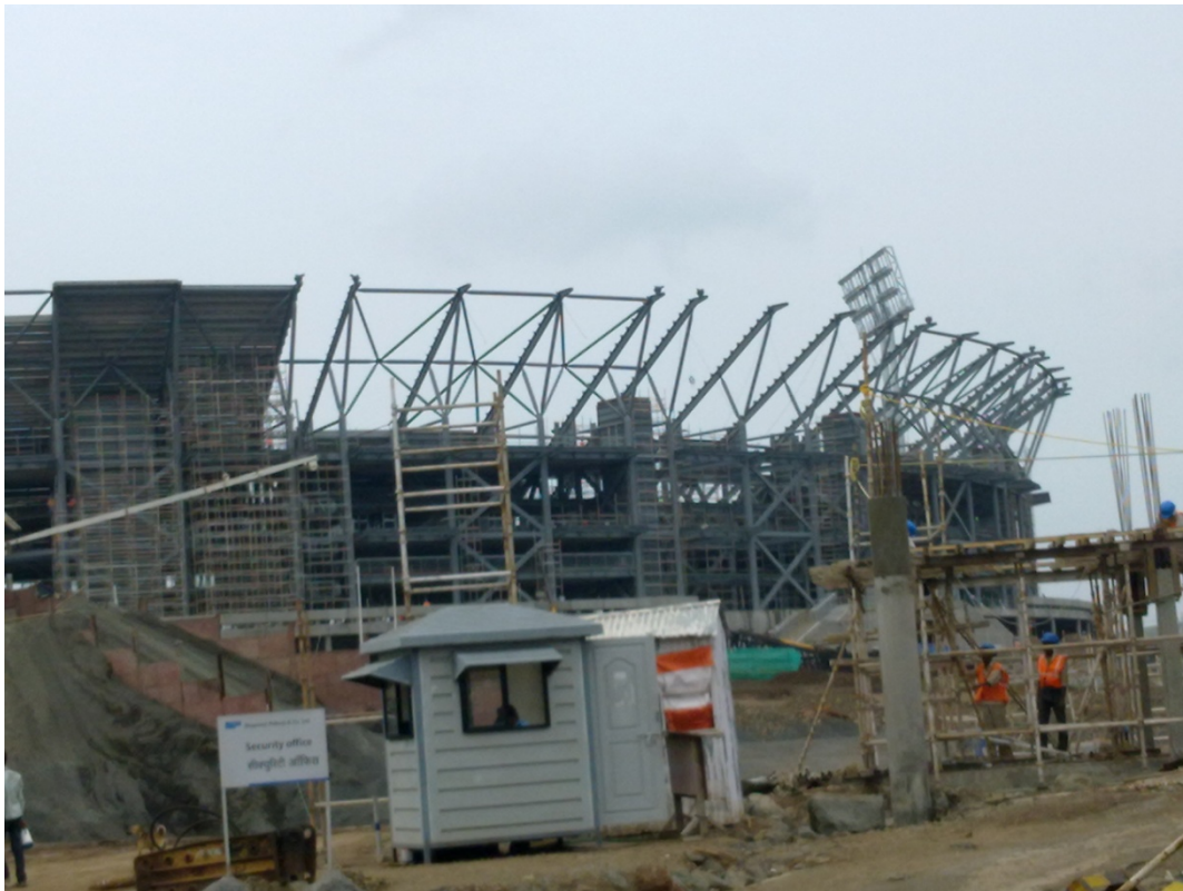
MCA Cricket Stadium Structure