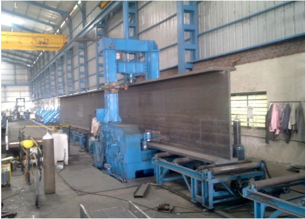
Beam Line Manufacturing – Hydraulic Forming & Straightening Machines