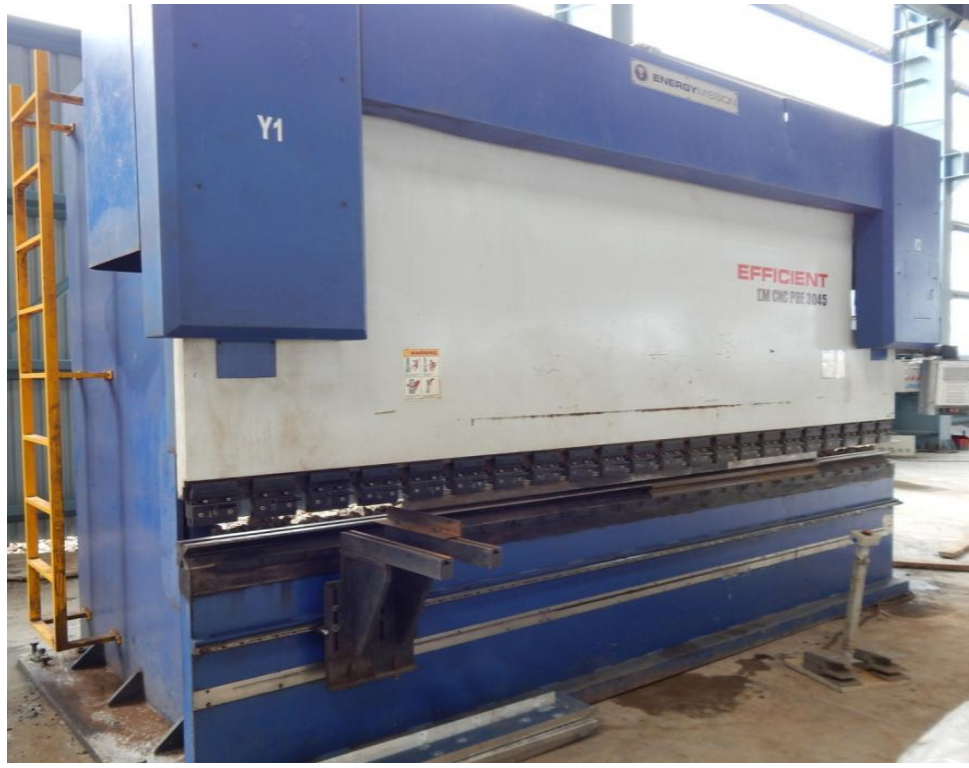
CNC Press Brake Machine