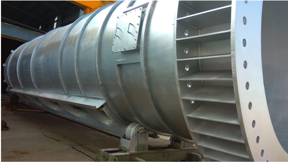
Stack (Chimney) Fabrication