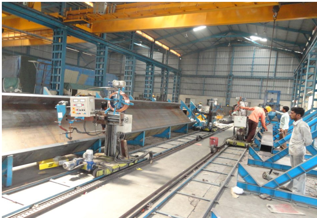
Beam Welding Line (SAW)